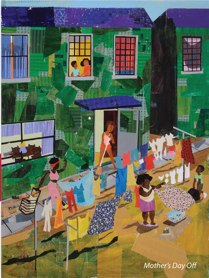
Mother's Day Off