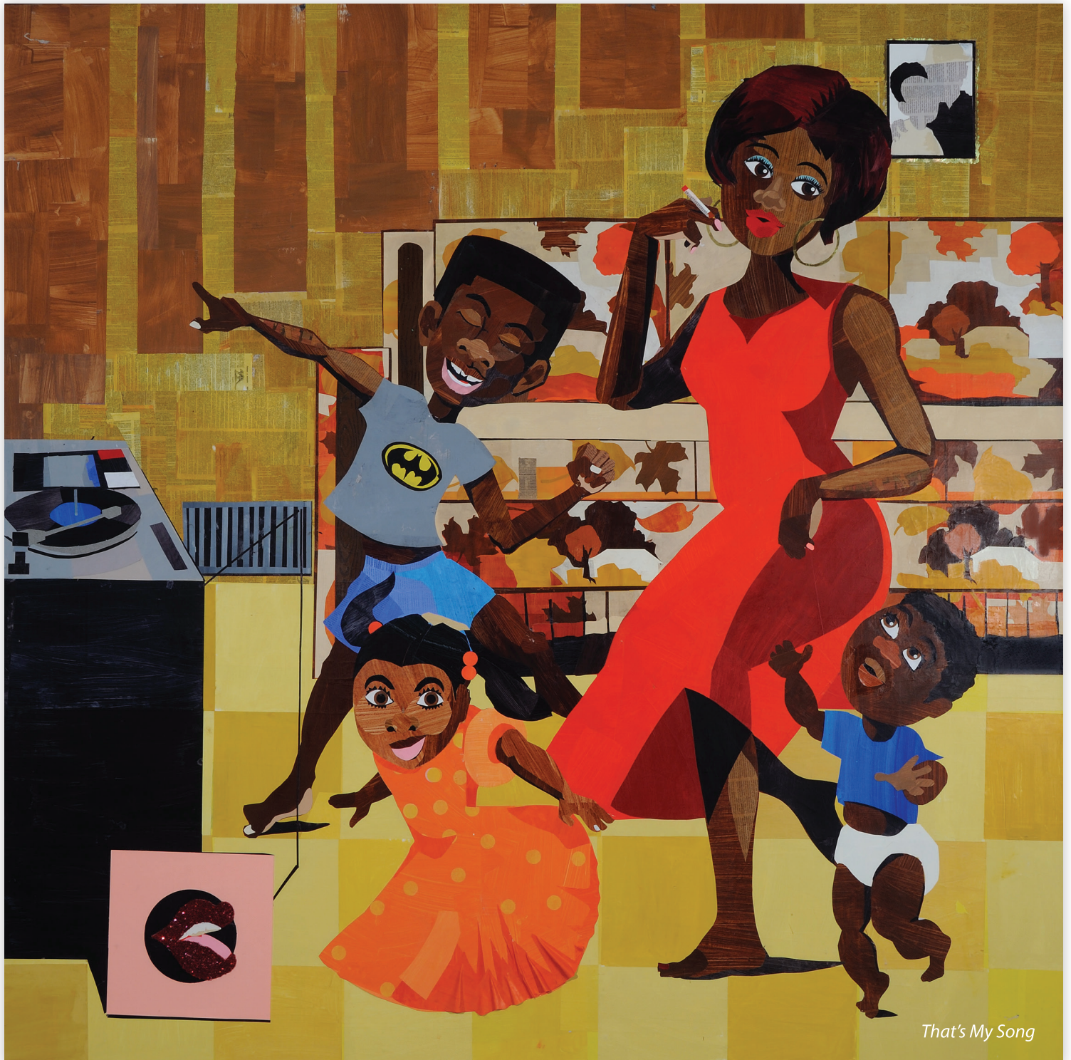
That's My Song